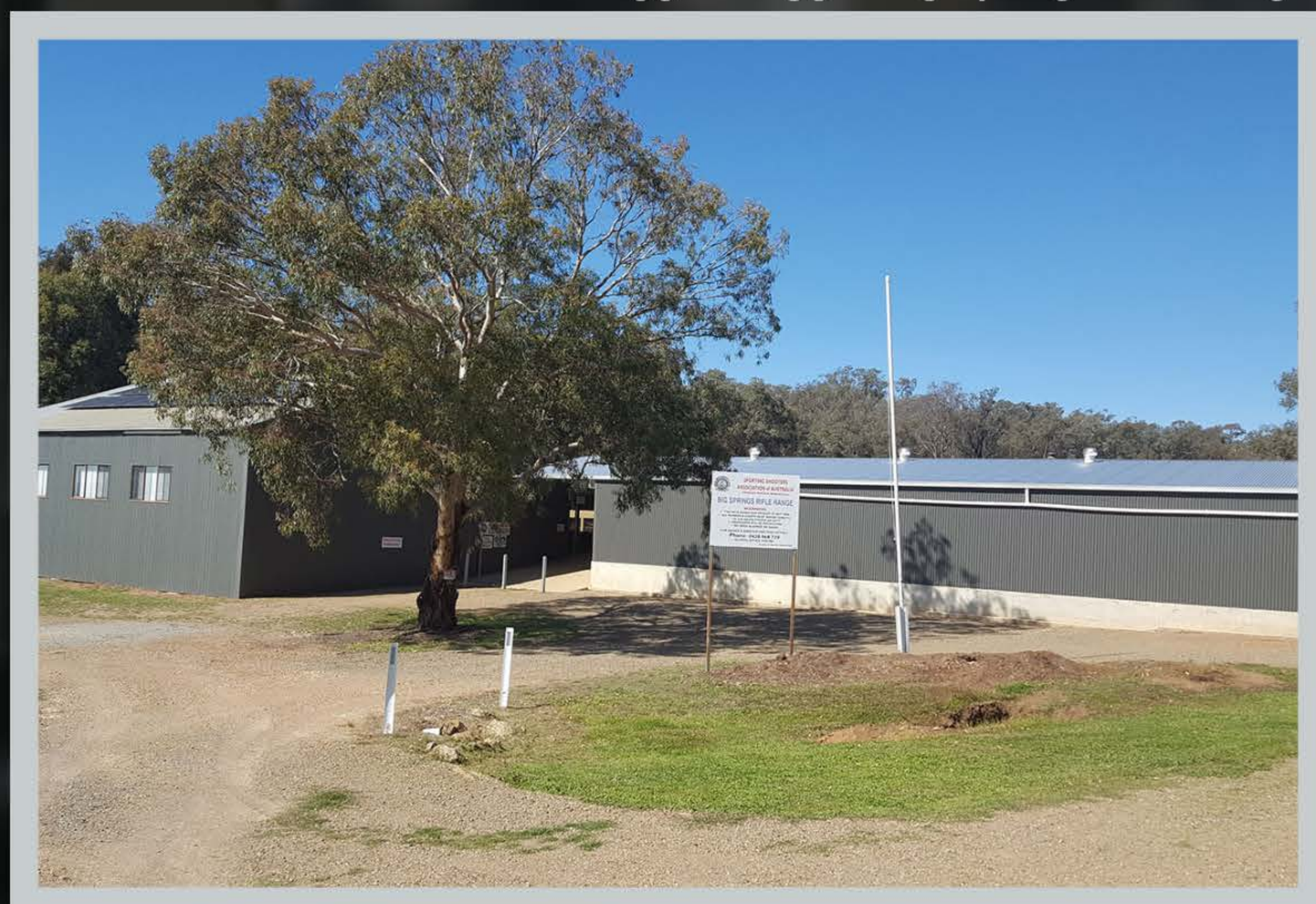
Pic: SSAA Wagga Wagga- Big Springs Rifle Range

There is a dedicated group of competition shooters competing in shoots every Sunday morning and some Saturday afternoons; the rest of the time is taken up by casual plinkers, hunters and competition shooters looking for that winning edge.